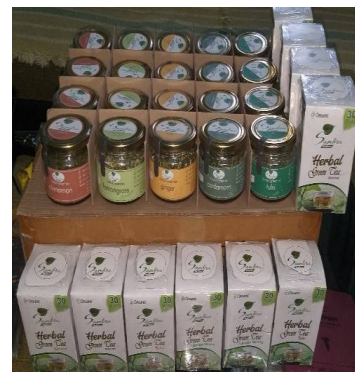
Sambru Green Tea

Different Flavours of Green tea (Mulberry)