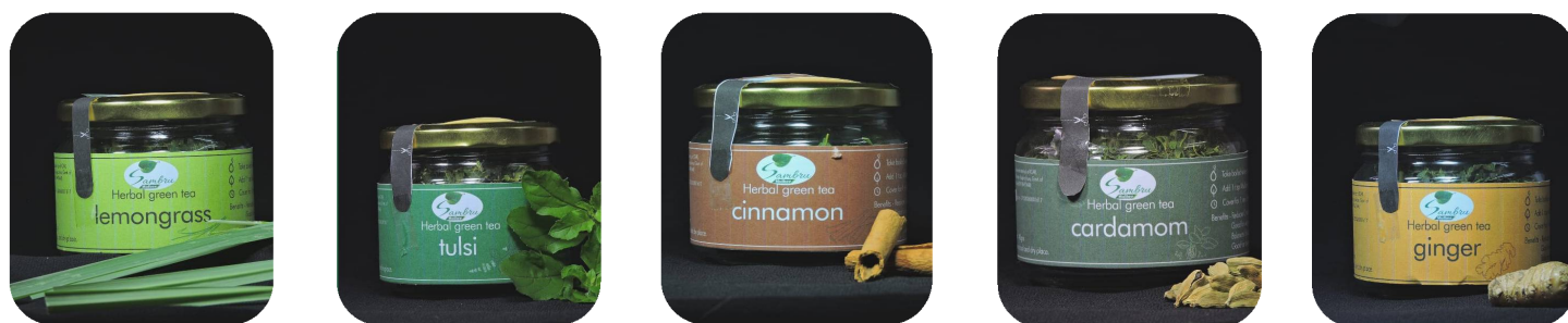
Sambru Green Tea with 5 different flavours

The incubation support helped the startup to promote products in the market and the farmers set up the new technology. The CIRCOT R-ABI expert's view helped the startup to channel the program on right track and expand the business idea to farmers all over India.